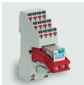
LCIS 3 relays