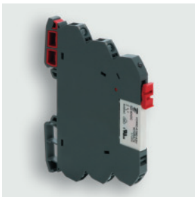
Pluggable LCIS relays

The LCIS relays offer compact, innovative terminal block style relays for a wide range of industrial applications. LCIS 2 relay series includes units with 1 or 2 changeover contacts, and the LCIS 3 relay series has units with 4 changeover contacts. LCIS relay series create optimal connections between the field level and the control cabinet.