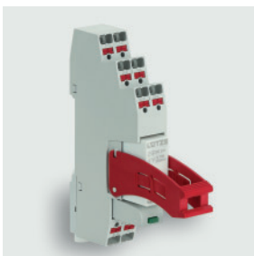
LCIS 2 relays